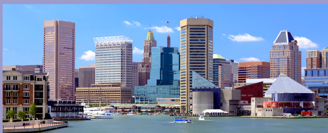
Baltimore's Inner Harbor